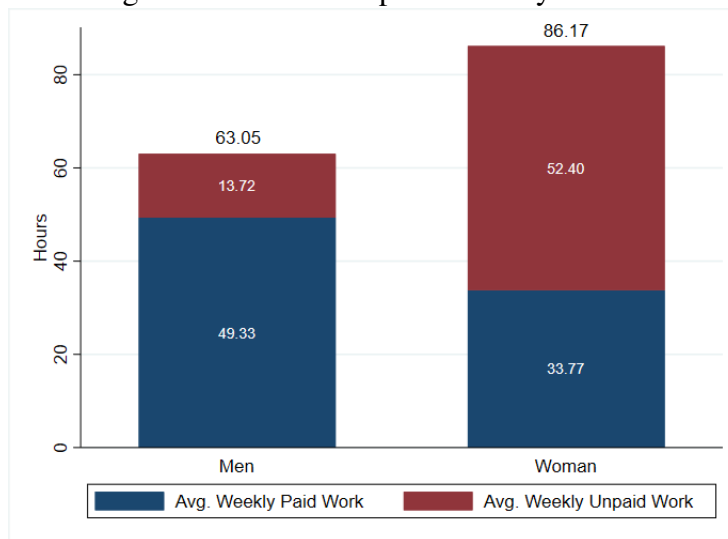
Figure 2: Paid and Unpaid Work by Gender

Figure 2 also presents the significant gender disparity in unpaid work activities, with women dedicating 38.68 hours more per week than men to these tasks. This difference is particularly evident in household chores, where women invest an additional 29.31 hours weekly compared to men. The primary component of it is cooking activities, where women spend 11.07 hours more than men, and cleaning, with a difference of 11.90 hours. Furthermore, women devote an extra 9.61 hours per week to caregiving activities. A deeper analysis reveals that women spend 10.99 more hours per week on childcare and 7.50 more on disabled care than their male counterparts. Interestingly, men tend to dedicate more time to community service and volunteering than women. Women spend 2.03 more hours in personal activities than men, mainly due to time spent on personal care and learning.