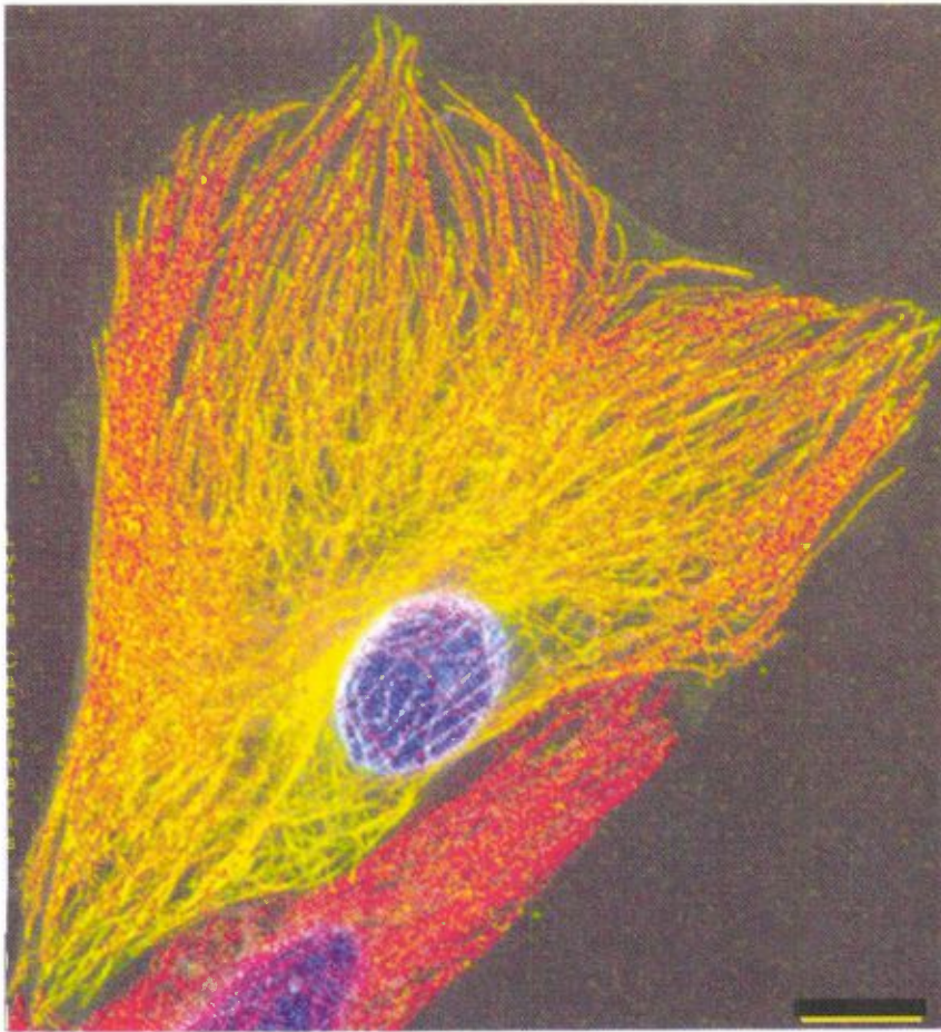
Figure 1. Did this cell originate by direct filiation from an archaeobacterium? The image shows a porcine epithelial cell (cell line LLCPK) fixed in -20^{\circ}\text{C} methanol. The microtubules, stained in red, were labeled with an Alexa-568 fluorescent antibody to alpha-tubulin. The microtubule tip-binding protein EB1 was stained green with an Alexa-488 labeled antibody (see Piehl and Cassimeris, 2003). The DAPI-stained blue nucleus can be clearly distinguished. EB1 binds to the tips of growing microtubules, highlighting the dynamic nature of the eukaryotic cytoskeleton. Growth and shortening of microtubules allows them to probe throughout the cytoplasmic volume and to connect distant regions of the cell via transport by molecular motors. Confocal fluorescent light micrographic unpublished image courtesy of Lynne Cassimeris, Department of Biological Sciences, Lehigh University, Bethlehem, PA, USA. Scale bar = 10 micrometers. See cover illustration.