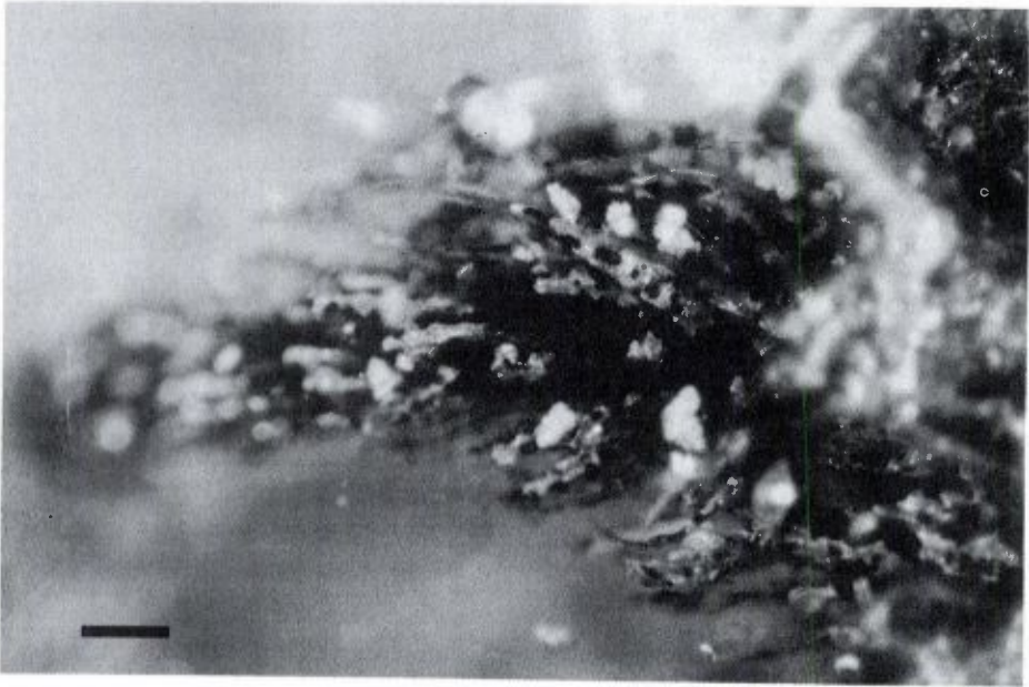
Figure 2. Fossilized pre-thallus stages of lichen in Baltic amber. The amber specimen (Oschin 5/01) is 35–55 million years old. Scale bar = 1.0 mm.

Some lichenicolous fungi have evolved from lichenized ancestors – they continue to depend upon specific photobionts without the need to find an appropriate free-living symbiont during each reproductive cycle (Rambold and Triebel, 1992; Peröoh and Rambold, 2002; Lawrey and Diederich, 2003). Concurrently, the host ranges of these fungi may often appreciate guild boundaries. There may also have been some cases in which non-lichenized organisms have managed to enter into established lichen guilds. For example, the evolution of some basidiolichens may include examples of this (Sanders and Lücking, 2002). While gains of lichenization have probably been relatively infrequent, there may have been multiple losses of the lichen symbiosis in different fungal lineages. As a consequence, several lineages of exclusively non-lichenized fungi have derived from lichen-forming ancestors (Lutzoni et al., 2001).