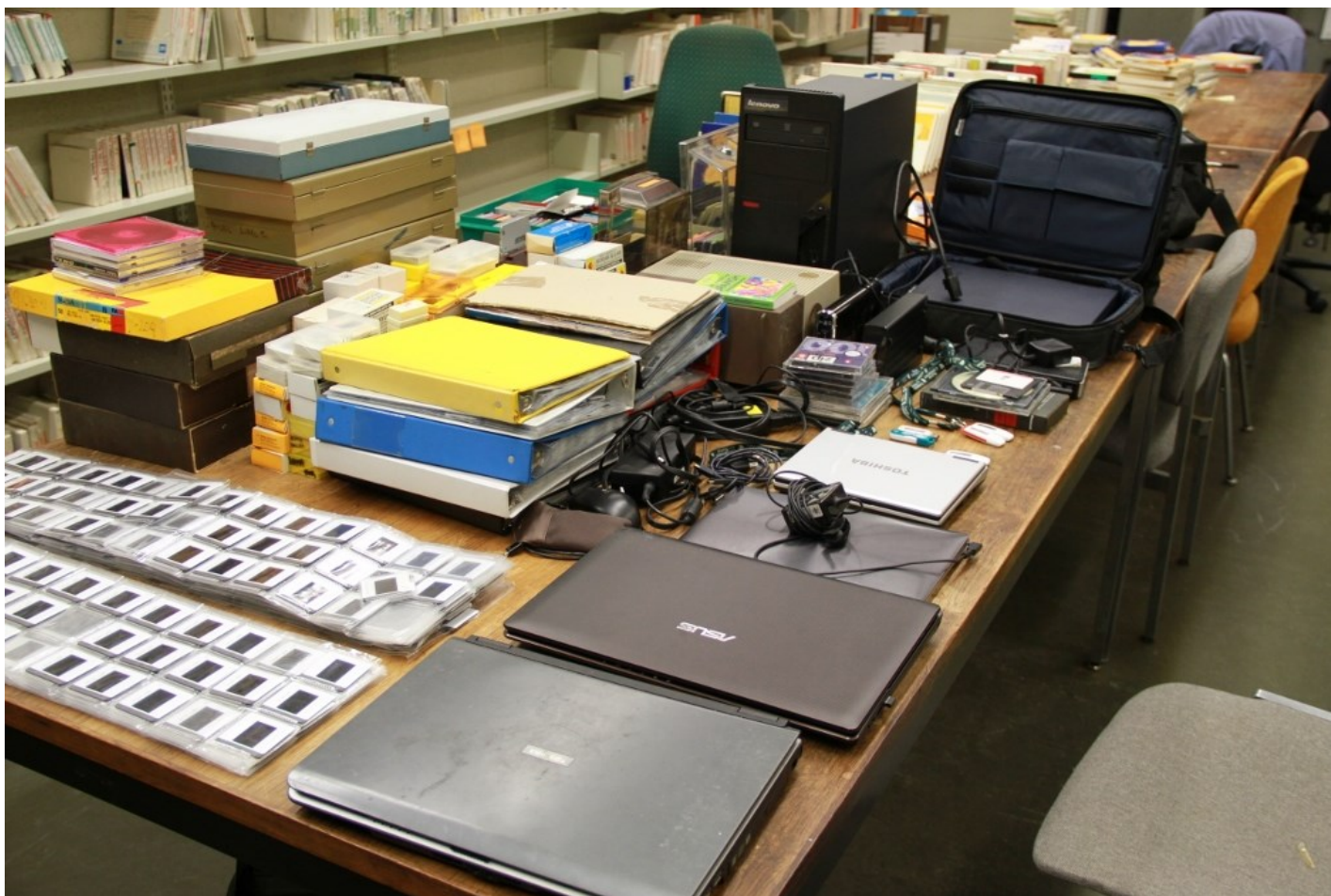
Photograph of Bill Freedman's slide library and computers