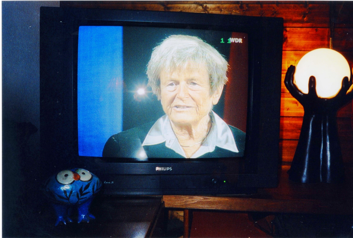
Photograph of Elisabeth Mann Borgese on a television program, MS-2-744 , Box 237, Folder 30, Item 1