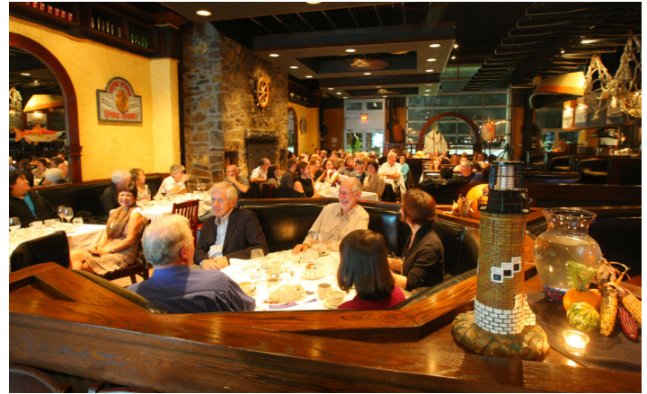
Lobster dinner at the Waterfront Warehouse