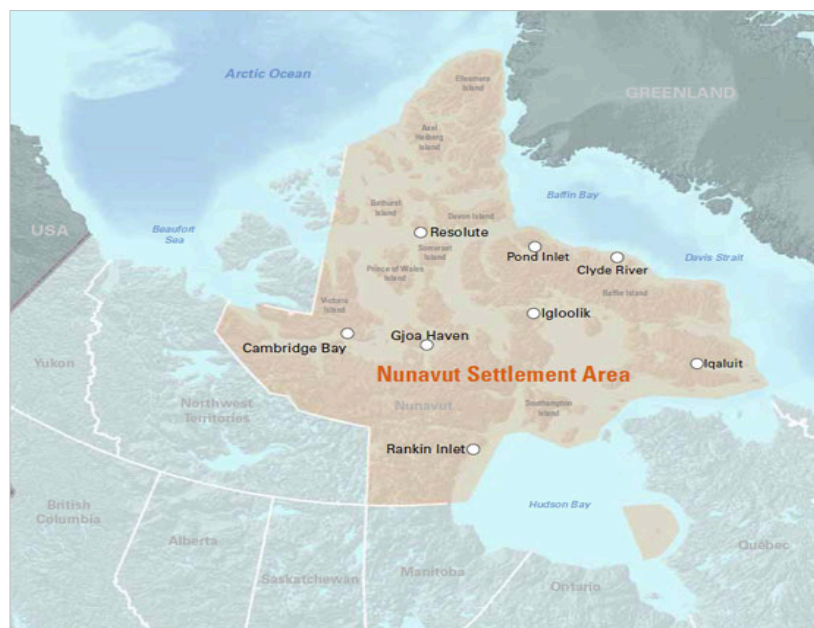
Figure 1 – The Nunavut Settlement Area as defined by the Nunavut Land Claims Agreement (National Energy Board, 2015 [2]).

The preamble to the NLCA describes the agreement’s objectives: 1) to provide for certainty and clarity of rights to ownership and use of lands and resources and of rights for Inuit to participate in decision-making concerning the use, management and conservation of land, water and resources, including the offshore, 2) to provide Inuit with wildlife harvesting rights and rights to participate in decision making concerning wildlife harvesting, 3) to provide Inuit with financial compensation and means of participating in economic opportunities and 4) to encourage self-reliance and the cultural and social being of Inuit (Nunavut Land Claims Agreement, 1993, p. 1). These objectives delineate the significance of Inuit pursuing economic opportunities and self-reliance, while preserving their cultural and social wellbeing. Additionally, the NLCA provides Inuit with the right to use and make decisions about resources within the NSA (as outlined in Figure 1).