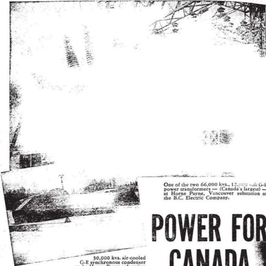
One of the two 66,000 kva., 12,000 volt G-E power transformers — (Canada's largest) — at Horne Payne, Vancouver substation of the B.C. Electric Company.