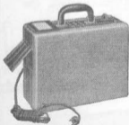
MODEL E.P. 551