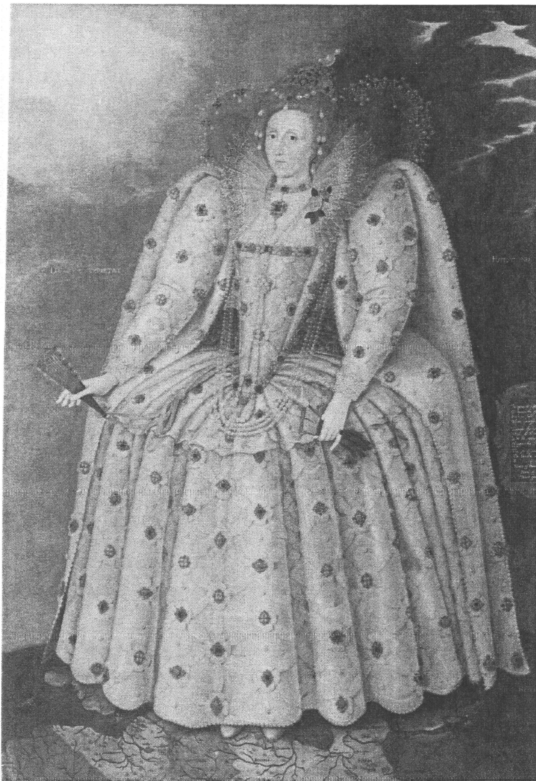
Figure 4. Marcus Gheeraerts the Younger, "Elizabeth I, the Ditchley Portrait" (1592). National Portrait Gallery, London.