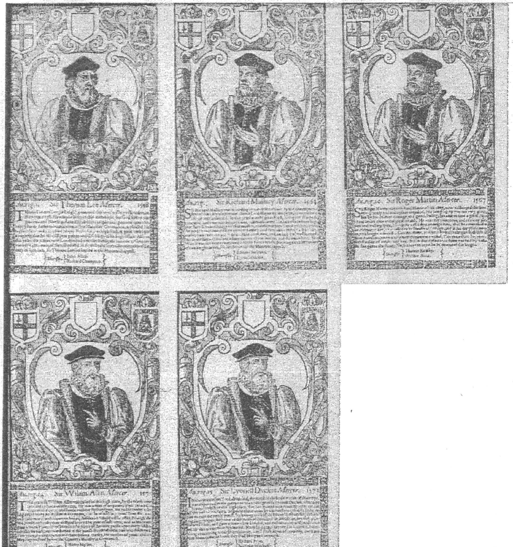
Figure 2. From William Jaggard, "A View of all the Right Honourable the Lord Mayors of London" (London 1601).

biographical sketches of London's lord mayors, he used but three woodcuts in rotation, each of them very stereotypical, to represent several score lord mayors [see Figure 2, below]. Perhaps all lord mayors in those days looked just like these three images, but then again, maybe not!