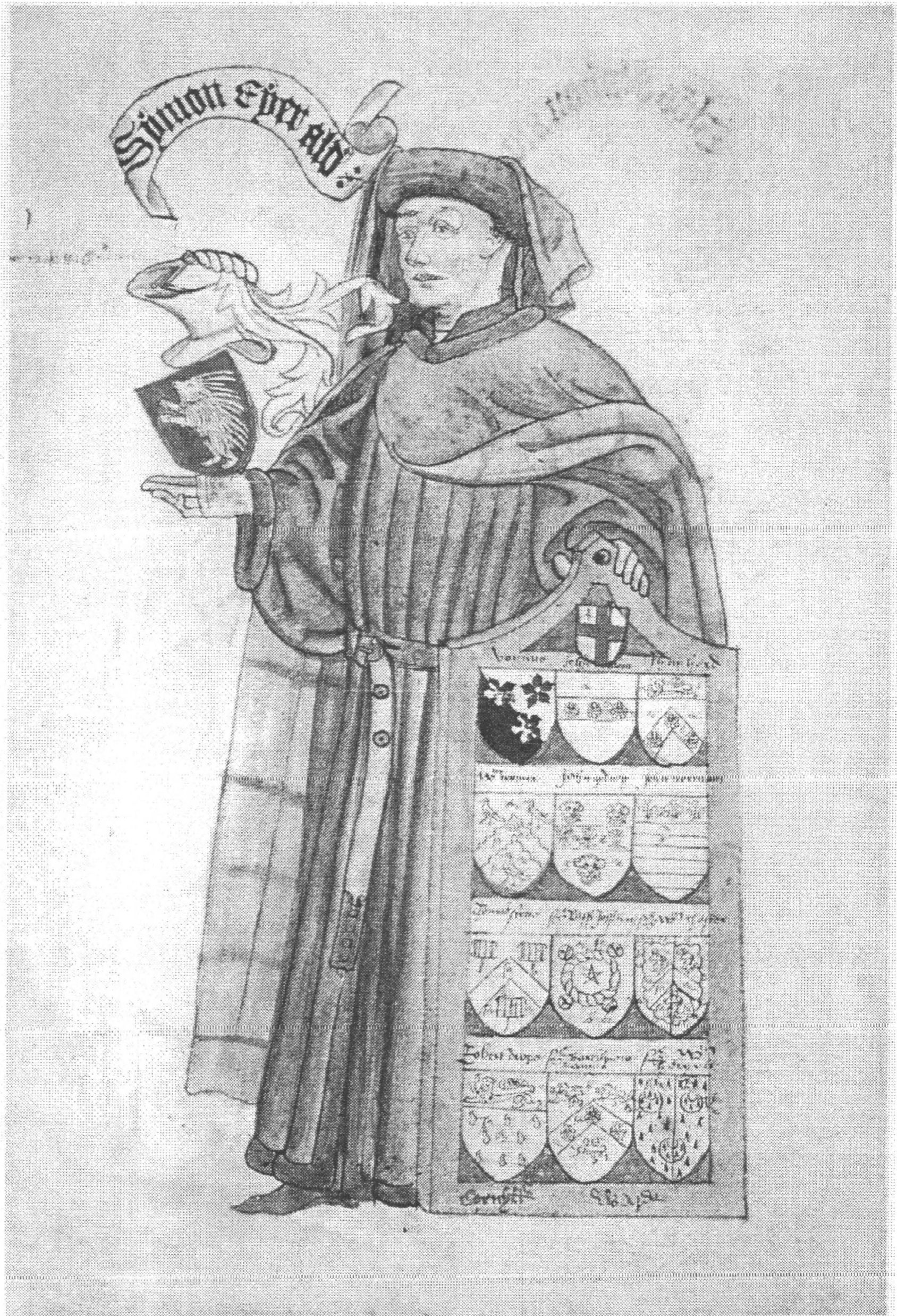
Figure 1. Roger Legh, "Simon Eyre, Draper and Lord Mayor of London, 1445–46," Guildhall Library MS. no. 32139. Guildhall Library, Corporation of London.