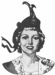
THE MACDONALD LASSIE