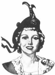
THE MACDONALD LASSIE