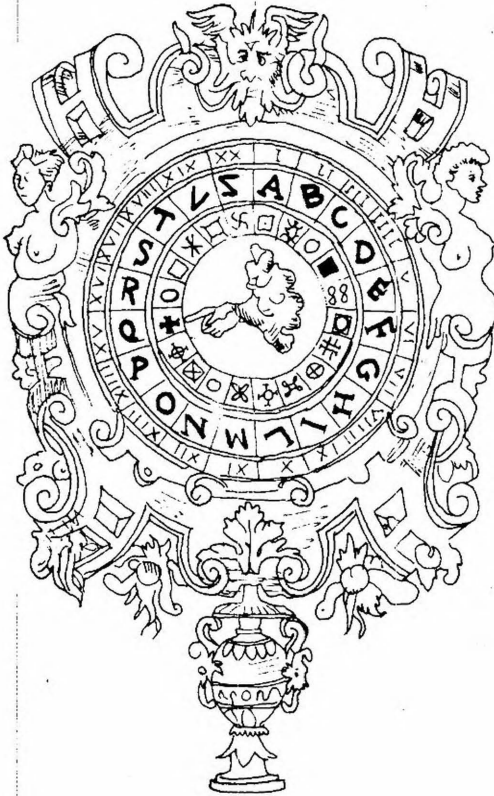
One of Giovanni Battista Porta's Cipher Disks