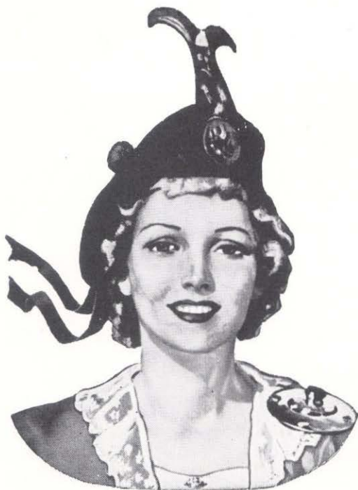
THE MACDONALD LASSIE