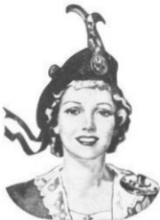
THE MACDONALD LASSIE