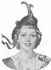
THE MACDONALD LASSIE