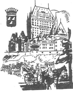
Chateau Frontenac, Quebec.

At the baronial Chateau Frontenac, Quebec, and The Royal York, Toronto, as at other business centres or beauty spots you will find unsurpassed service and accommodation with delightful meals and perfect facilities for entertainment. Relax and recuperate so that you may continue your work refreshed in body and spirit.