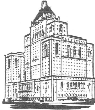
Royal York, Toronto

At strategic points between the Atlantic and Pacific, the Canadian Pacific has established a chain of hotels. They were never more needed or more beneficial than today. When you travel on your wartime mission, they are at your service.