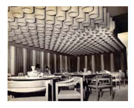
Faculty Club - The Dining Room, November 9, 1972