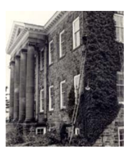
Workmen remove the two-feet thick