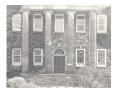
The Old Law Building, n.d.