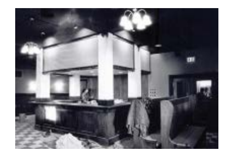
Construction of Faculty Club Pub - Bar Area, January 10, 1980