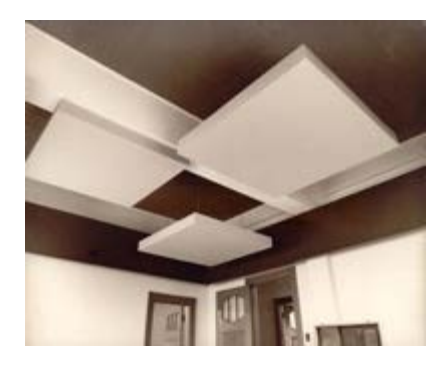
Dalhousie Faculty Club - Under Construction Interior - Square Ceiling Fixtures, February 15, 1972