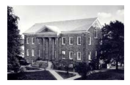
The Faculty Club, n.d.

ivy from the old Dalhousie Law School, February 1966