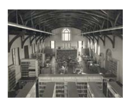
University Club (Law Library classroom), n.d.