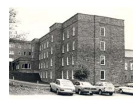
Howe Hall exterior, October 1977