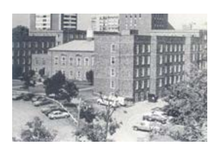
Howe Hall looking northeast, 1985