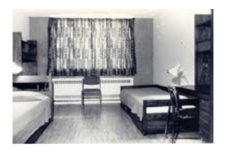
Howe Hall - Interior - Dorm Room, n.d.