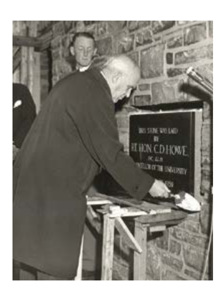
Cornerstone Laying - Men's Residence - Howe Hall, October 1959