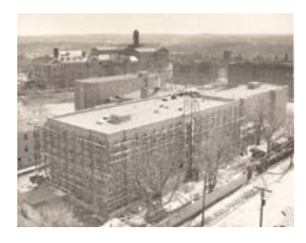
Howe Hall Men's Residence -Renovations, December 14, 1964