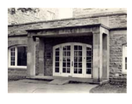
Howe Hall - Exterior - Front Entrance, 1977