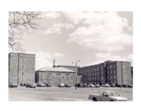
Howe Hall - Exterior - Buildings and Parking Lot, n.d.