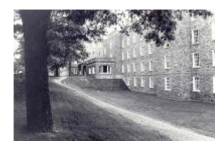
Howe Hall - Exterior, n.d.