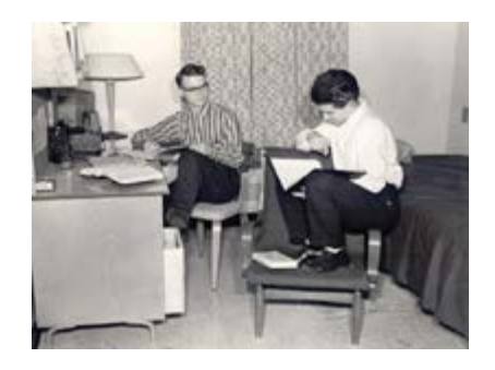
Students in Howe Hall Men's Residence at Dalhousie University, n.d.