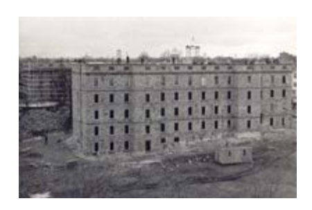
Howe Hall Men's Residence Under Construction, December 14, 1959