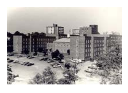
Howe Hall and Adjacent Buildings, n.d.