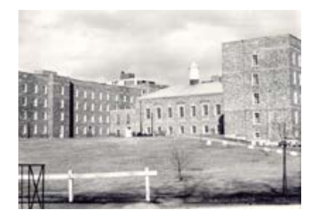
Howe Hall - Men's Residence, October 1976