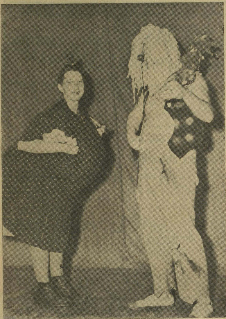
Widow Fruitful and Hairless Joe