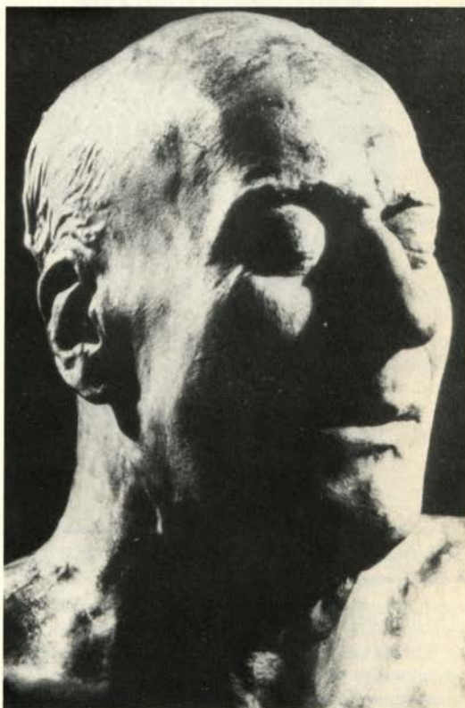
Fig. 3 The death mask of Samuel Johnson. The scars of scrofula can be seen on his neck.

The surgeon, William Cruickshank, was asked to make cuts in his legs to drain the edema. Afraid of gangrene he made very superficial cuts. Johnson cried out "deeper, deeper. I want length of life, and you are afraid of giving the pain which I do not value." It was probably on this occasion that Johnson reproached Heberden with being "timidorum timidissimus" for supporting Cruickshank in refusing to make deeper cuts. When Cruickshank left, Johnson took scissors and stabbed deeply into the calves of his legs. He bled a great deal and Cruickshank had to be called back to dress the wounds. Although there is debate about Johnson's last words, Bate states that on Monday, December 23, Johnson in a delirium murmured, "Jam moriturus" (now am I about to die), echoing perhaps the ancient salutation of the dying gladiators to Caesar. He died that evening. (Figure 3)