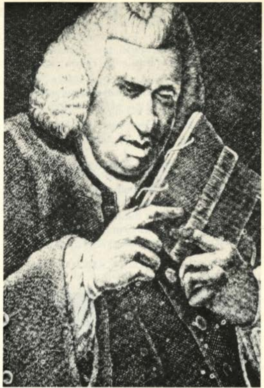
Fig. 2 Dr. Samuel Johnson squinting to read. Poor vision was but one of his many medical problems.

His comment about hearing is appropriate because he was deaf in his left ear. There are more than a dozen references in his own writings to his hearing problems which he felt resulted from the scrofula. It has been said that his dislike of the visual arts was due to his visual difficulty and his dislike of music and the theatre was due to his poor hearing.