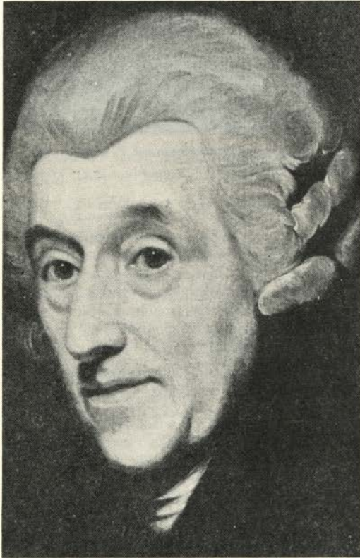
Fig. 1 Dr. William Heberden, referred to by Johnson as, "ultimus romanorum. The last of our learned physicians".

The physician William Heberden (1710-1801) who attended Johnson during the last two years of his life, had, like his patient, risen from any modest beginnings to a lasting place in the annals of history (Figure 1). The relationship between the distinguished medical practitioner and the giant of 18th Century literature is perhaps of interest to historians of both.