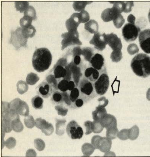
Fig. 1 A bone marrow macrophage displays a voracious appetite for leukocytes and erythrocytes in this striking example of hemophagocytosis. The open arrow points to the nucleus of the macrophage for orientation. Wright's stain. X400

A rare familial disorder of infants, hemophagocytic lymphohistiocytosis, and the infection-associated hemophagocytic syndrome probably represent conditions, broadly referred to as hemophagocytic syndromes, in which there is more global activation of the MPS. Both disorders present with fever, pancytopenia, hepatosplenomegaly, signs of hepatic dysfunction, bleeding diathesis and neurological manifestations. Hypertriglyceridemia and spinal-fluid pleocytosis are characteristically present and there is lymphohistiocytosis and hemophagocytosis in the bone marrow (Figure 1). 11