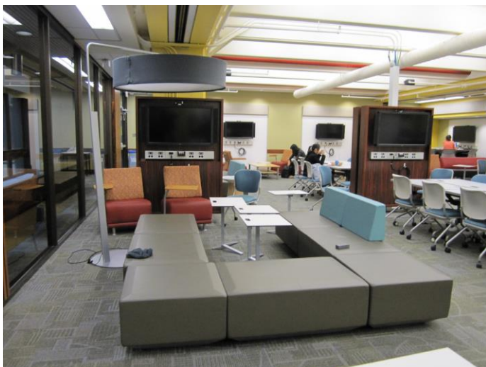
Figure 4: LINC Classroom/Study Space, Dalhousie Killam Library

Findings of an internal survey of library workstation users (conducted at the same time as this study) support the SOSA majors' belief that many students, with or without laptops, prefer working in public spaces to help with their focus. Within their comments, many survey respondents indicated that they purposely choose the public spaces of the library and the computer workstations to force themselves to focus on their work and limit leisurely distractions, specifically the distractions on their personal laptops (Bedwell and Comeau 9). The survey also revealed that laptop owners had to rely regularly on the computer workstations for printing purposes, confirming the SOSA majors' observations of laptop users leaving their laptop to quickly use a desktop computer. Since both the participant observation study and the workstation survey, the library's information technology services department has improved wireless printing capabilities. Further study will reveal the effects of this enhanced service on laptop and workstation use.