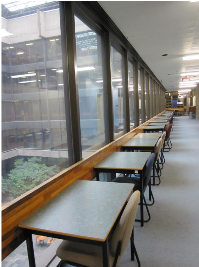
Figure 3: Individual Study Tables in Atrium Hallway, Dalhousie Killam Library

The major finding regarding human traffic flows was that some of the heaviest foot traffic occurred in areas designated as quiet study spaces. These include the atrium hallways of the 4th and 5th floors. (See Figure 2 for an atrium hallway layout, and Figure 3 for a photograph of an atrium hallway.)