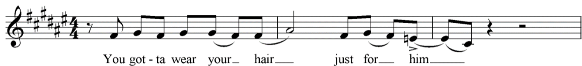
Figure 2.1: Martha Reeves’s “Wishin’ and Hopin’” interpolations as performed in The Sound of Motown 32

The first comparison concerns interpolations and embellishments added to the song’s melody. During The Sound of Motown performance in 1965, both Dusty and Martha Reeves add interpolations that are not present in Dusty’s 1963 studio recording. The first interpolation is sung by Reeves (Figure 2.1), “You gotta” before the lines “wear your hair just for him.” Reeves’s phrasing is very loose, which is a result of her frequent use of vocal slurs, as demonstrated in Figure 2.1. In the second verse Dusty answers this with a very gritty and soulful, “You gotta do the things he likes to do,” (Figure 2.2). 31