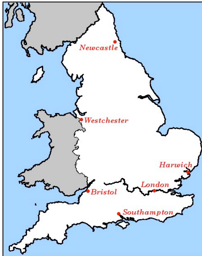
Figure 1 The six ports of Edward Hayes' 1586 treatises

Few merchants, however, were likely to deal exclusively in trade. Their occupations were loosely defined in the sixteenth century and did not preclude earning income in other ways when opportunities arose. Merchants could be the sons of landed gentry such as Parkhurst, drawn into trade because they had the right connections and finances to establish themselves. However, they were often occupational chameleons such as Edward Hayes, proposing various projects to their patrons in search of other employment. Such men were highly adaptable by necessity and juggled a number of interests in England, Ireland, and the wider Atlantic. For Hayes especially, the colonization of Newfoundland was simply one of many schemes that he proposed to Burghley and his son Robert Cecil, Earl of Salisbury, between 1579 and 1613. 101 Like Parkhurst, these projects included other colonial ventures that he could lead in the North