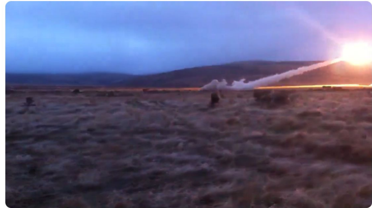
5-3 / A 1-94 HIMARS live fire at Yakima Training Center Nov

The solution: what options would you suggest to the faculty member as your institution's copyright specialist?