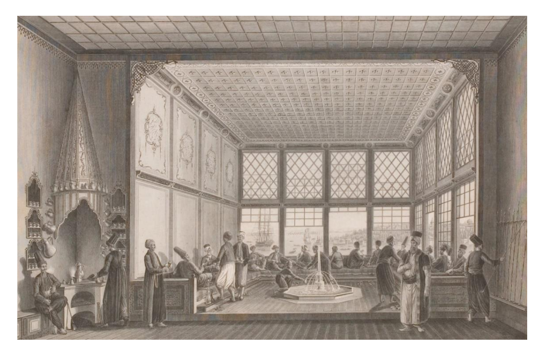
The Meydan of an 18th century Istanbul coffeehouse with a view of the Bosphorus.<sup>112</sup>

publicly discussed casually alongside matters of politics and religion; he frowned upon such conversations for their 'rabble-rousing' qualities, while he looked askance at the young beardless male servers which were employed by the coffeehouses.<sup>110</sup> In summation, Ali objected to the crass, socially inflammatory behaviour of unenlightened intermediate social bodies, and this was a critique of organized gatherings that echoes an Abbasid political tradition of preventing the free assembly of structured groups.<sup>111</sup> For all his detail and critique, Ali claims to never have entered a coffeehouse personally, and insists that his reports predominantly stem from observations made from outside, where he took advantage of the open fronts and patios to make judgement. Whether Ali's alleged purity in regard to coffeehouse patronage is true or not, his criticism is nonetheless illuminating.