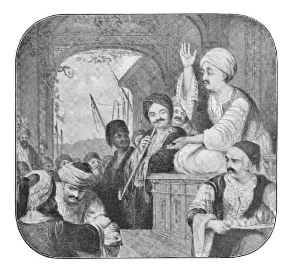
Scholars, Sufis, "idlers" and the rabble of the general public converse in a coffeehouse.<sup>181</sup>

society.<sup>180</sup> The need for heterotopias emerges from this tension, where spaces like coffeehouses can offer a reorientation of societal norms to suit the needs of heterodox actors. The unity of a common cultural staple like coffee with illicit or illegal conduct serves as one potential formation of a strong counterpublic, whose lifestyles differ from traditional public demands but whose relationship with the social world is still facilitated.