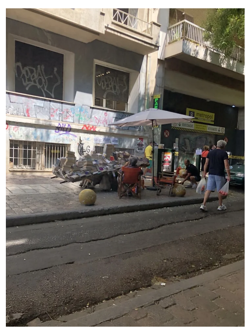
Victoria Square, Athens.

'There is a real kind of divide between the [local] community and the [international] NGOs. I also think that more could have been done to work with the local communities. And this definitely was an issue that [...] is a product of European migration policies made in Brussels. My perspective is that a lot of Europeans who come and work here understand this as a European issue.'