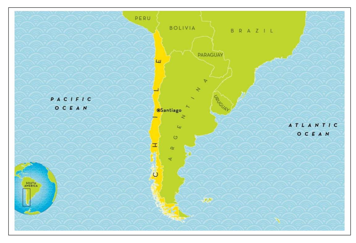
Figure 1:(National Geographic, 2014)

most populated Latin American country and falls behind the next most populated country of Venezuela by almost 10 million. Chile is a geographically diverse country that is recognizable for being long and skinny, extending 6437km along the Pacific Ocean (see figure 1), while averaging a mere 91km from east to west (National Geographic, 2014). Due to its length from North to South, it is one of the most diverse landscapes in the world, with the extremely dry Atacama Desert in the North, and the icy fjords of the southern cape.