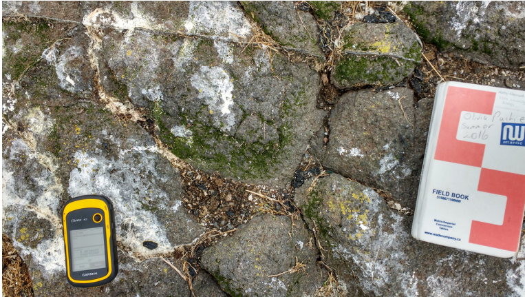
Fig 3 Portion of rock surface with typical patches of Prasiola crispa (green) and extensive gull droppings (white). Field book and GPS for scale.

neither droppings nor P. crispa . Of the 102 outcrops with gull droppings, P. crispa was present on 19 (18.6%). On some outcrops, there was a single well-defined patch from 10-50 cm 2 , whereas on other outcrops, there were many small to large irregular-shaped patches (Fig 3). Colonies were rare on the flat upper surface of the rock, fully exposed to the sun. Most colonies were on the sloped sides of the outcrops and many were north facing. Some patches were in depressions in the rock or shaded by adjacent shrubs or boulders.