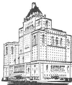
Royal York, Toronto

At strategic points between the Atlantic and Pacific, the Canadian Pacific has established a chain of hotels. They were never more needed or more beneficial than today. When you travel on your wartime mission, they are at your service.