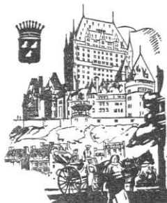
Chateau Frontenac, Quebec.

At the baronial Chateau Frontenac, Quebec, and The Royal York, Toronto, as at other business centres or beauty spots you will find unsurpassed service and accommodation with delightful meals and perfect facilities for entertainment. Relax and recuperate so that you may continue your work refreshed in body and spirit.