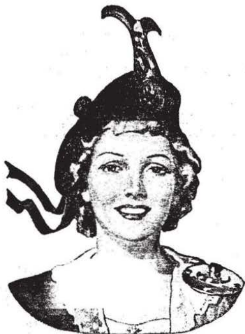
THE MACDONALD LASSIE