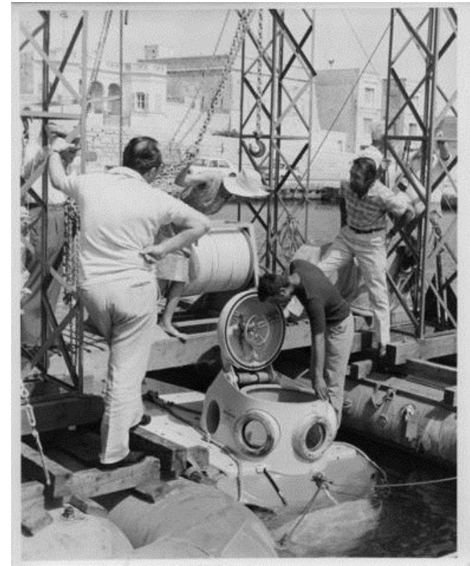
Photograph from Pacem in Maribus II, MS-2-744, Box 169, Folder 28, Item 13