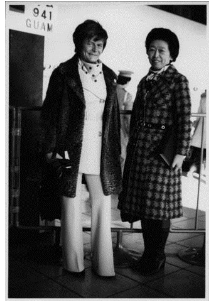
Photograph of Elisabeth Mann Borgese and a woman in Japan , MS-2-744, Box 169, Folder 30, Item 2