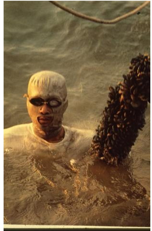
Slide depicting mussel farming, MS-2-744, Box 371, Folder 5, Item 126