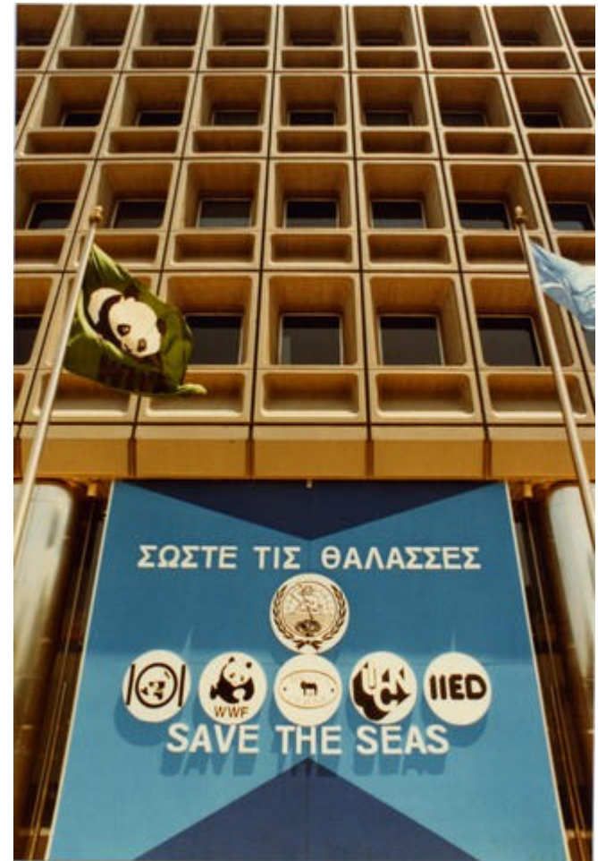
Photograph from a Hellenic Marine Environment Protection Association (HELMPEPA) event , MS-2-744, Box 237, Folder 53, Item 27