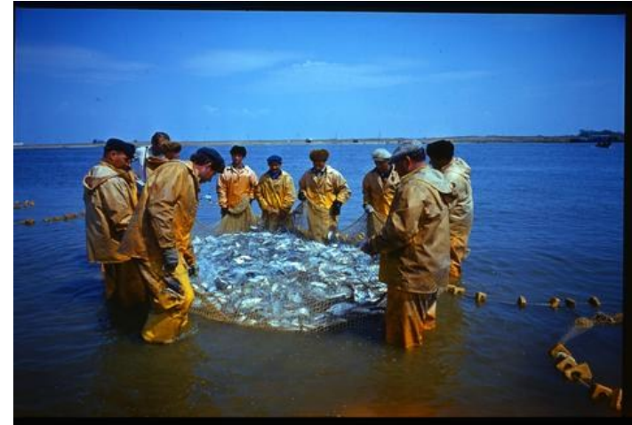
Photo negative of fisherman in Volga River , MS-2-744, Box 178, Folder 20, Item 6