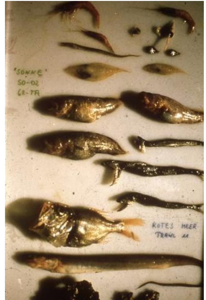
Slide depicting sea life, deceased , MS-2-744, Box 371, Folder 5, Item 143