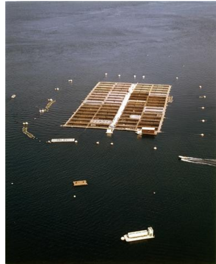
Photograph of a fish farm , MS-2-744, Box 178, Folder 5, Item 3