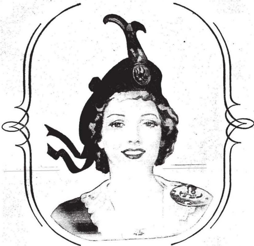
THE MACDONALD LASSIE