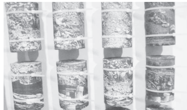
"Nuclear Cleanup of Tonawanda".