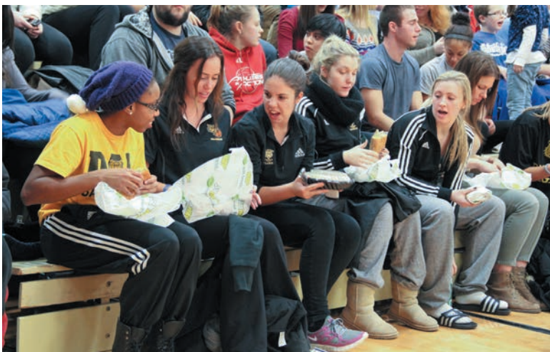
Women's team members enjoy a light moment after their victory over the Axemen.