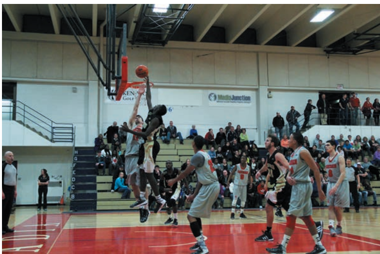
Tigers, Axemen go airborne.

Acadia University offers a four-month practicum in Shanghai.