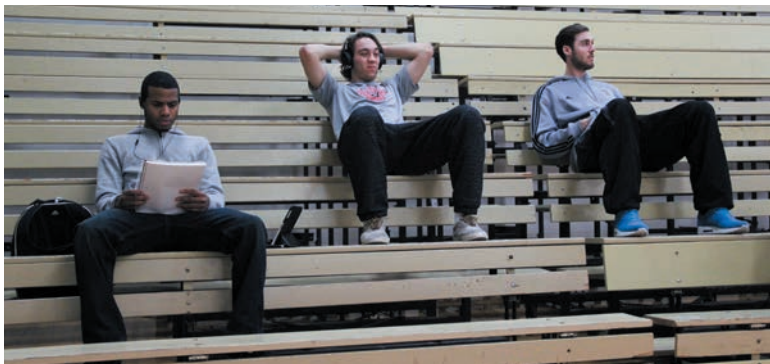
The men's Tigers relax as their female counterparts take the court before their game.