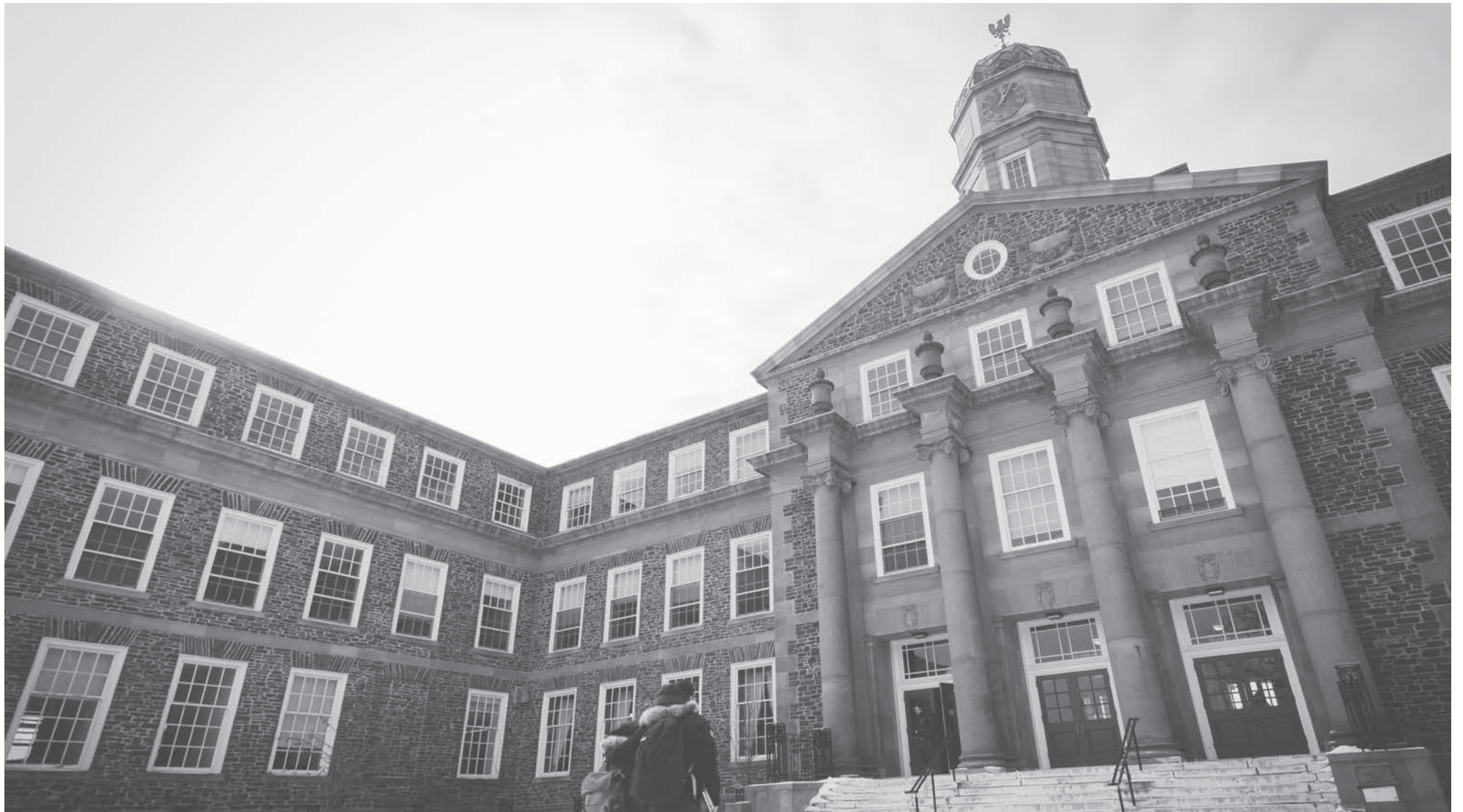
Tuition will go up for all students next year. ••• Photo by Calum Agnew