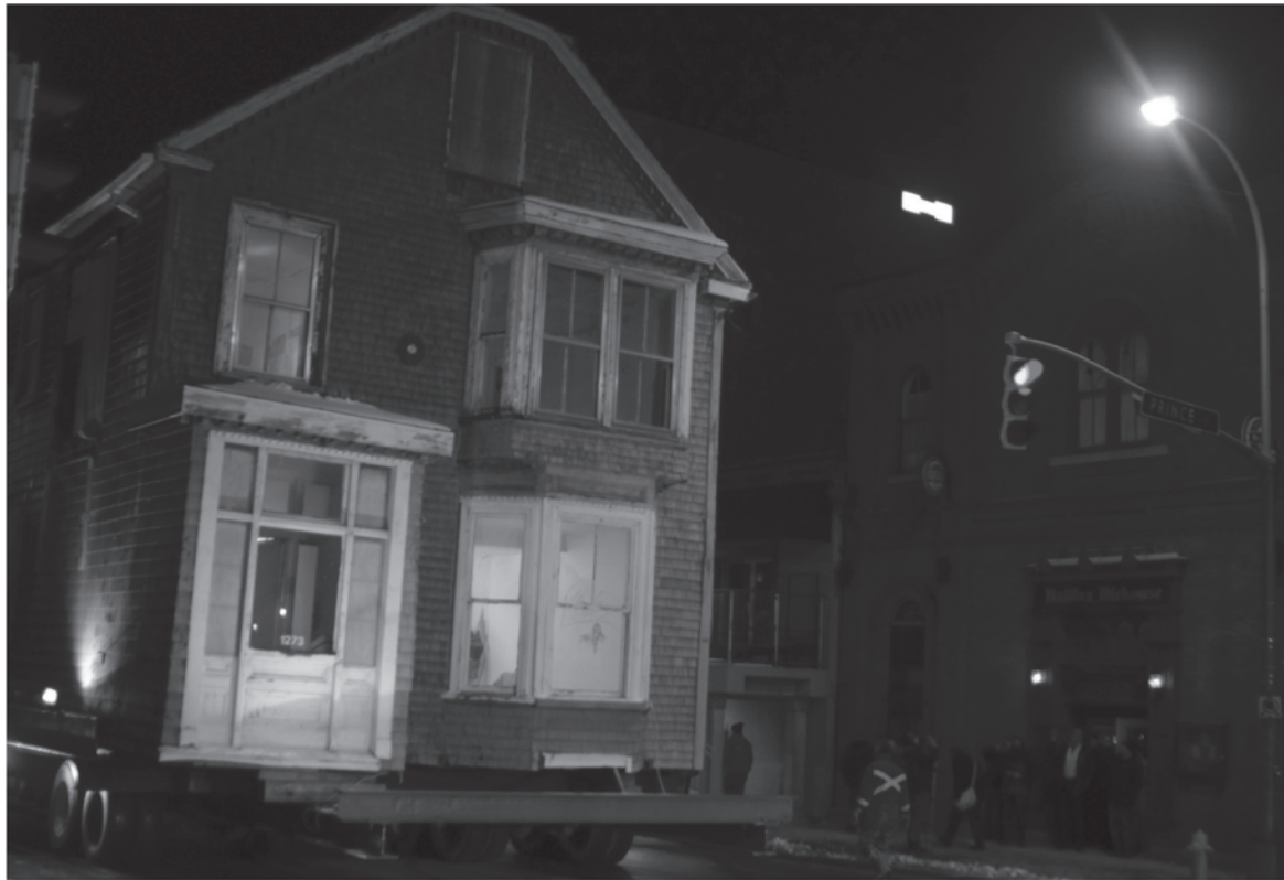
Matt Worona took this photo as confused revelers exited the Halifax Alehouse in the early hours of January 26.

The 4.5 km trek to the corner of Creighton and Charles streets was completed over 2 nights. On Saturday, January 26 at 3am, in the freezing cold, a collection of Haligonians passed up their precious slumber to watch the historic move. As they were pulling out, I arrived at the parking lot where the 27 tonne house has sat for three years. Approximately 25 residents were up watching the spectacle and another 20 workers were making sure the move ran as smoothly as possible. The temperature dipped to -35C with the windchill and the going was slow. With two pairs of pants and