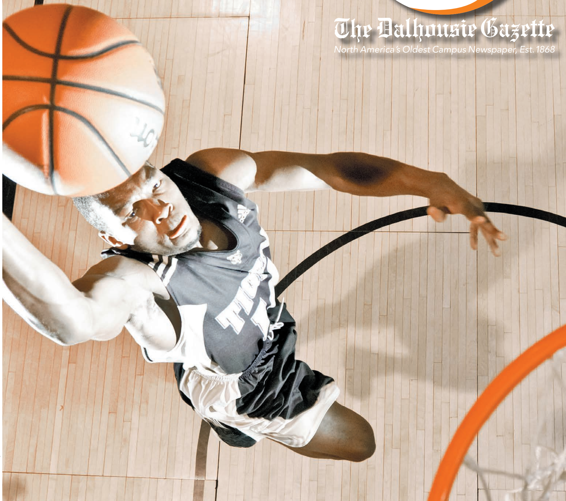
Cover Photo by Chris Parent

The Dalhousie Gazette North America's Oldest Campus Newspaper, Est. 1868