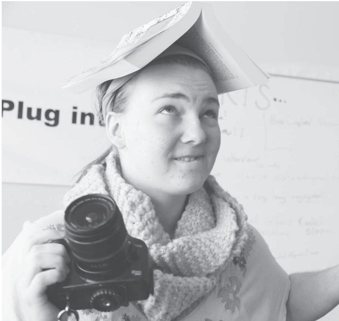
An argument against the inherent value of productivity. ••• Photo by Bryn Karcha