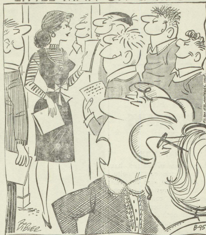
SOMETIMES I SUSPECT MISS LAMONT'S FRENCH CLASS MAY FALL INTO THE CATEGORY OF ENTERTAINMENT.