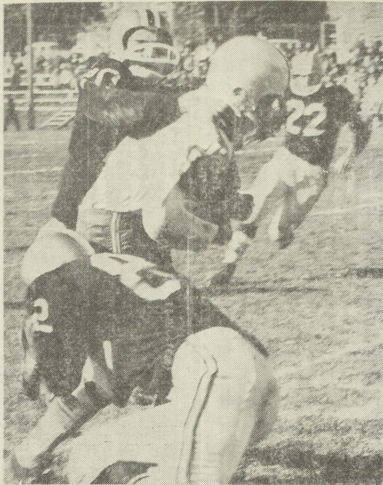
AN UNIDENTIFIED SHEARWATER ball carrier is tackled by two of the Dalhousie defensive unit in Saturdays game against the Flyers.

This year we are fortunate in having practise time available between 8:00 - 9:00 am; probable starting time Nov. 1. Please contact rink management for further details.