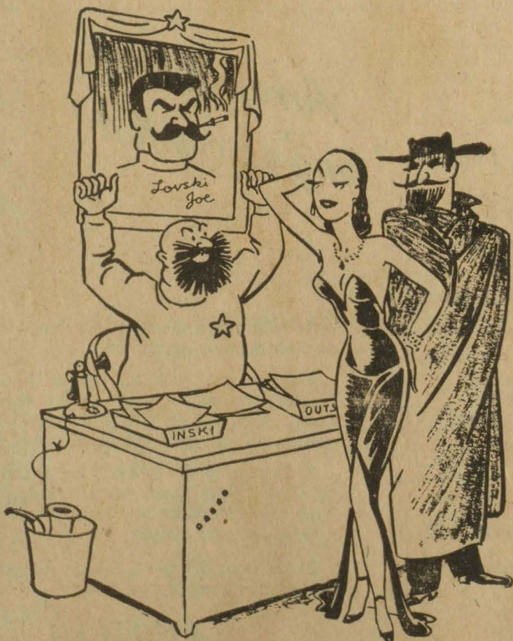
"Never mind the atom bomb, get the secret formula for Player's Cigarettes"