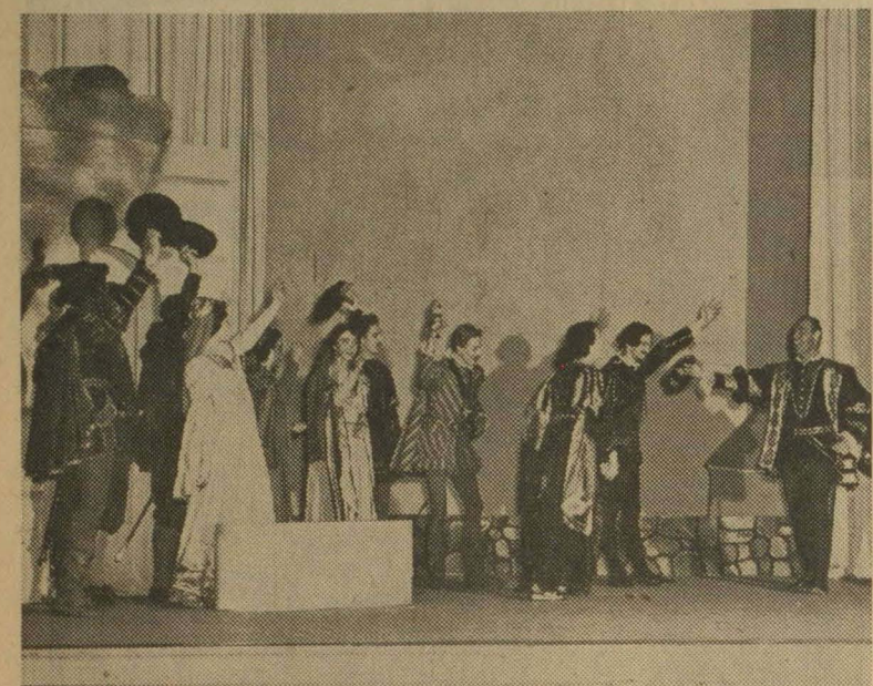
Some of the cast of the DGDS production of "Othello", which was seen last night by the students, and which will be presented tonight and tomorrow to the public.