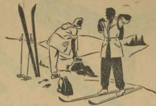
"Boy oh boy... am I ever ready for a Sweet Cap!"