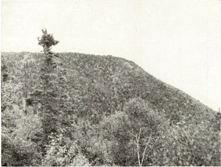
Figure 2. South side of Cape Smoky, Victoria Co., showing the characteristic ruggedness of the northern Cape Breton Island terrain.

elsewhere in this province, and this may indicate the presence of more truly boreal Lepidoptera than have so far been recorded; perhaps such species as Anomogyna homogena , A. speciosa , A. sincera , Diarsia pseudorosaria , Syngrapha montana , Dysstroma truncata and Xanthorhoe algidata will be found inhabiting the spruce forest atop French Mountain or North Mountain. Since the development of the National Park these localities have become somewhat more accessible than formerly, but have not yet received the entomological attention they deserve.