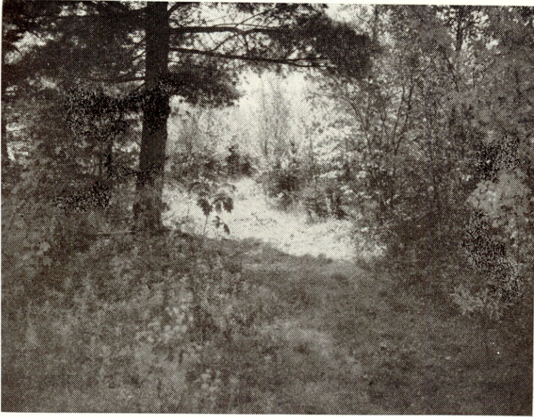
Figure 1. Typical Canadian Zone forest near Centerville, Kings Co. The numerous species recorded from Centerville were taken at light and bait along this old wood road.

This is the so-called Acadian Forest Region. The dominant trees are white and red pine, hemlock, balsam fir, larch, white, red and black spruce, yellow, white and gray birch, poplar, red maple, sugar maple, beech, red oak, Amelanchier , and white and black ash. Elm is conspicuous in the fertile river valleys. In effect, Nova Scotia provides a mixture of Alleghenian, Canadian and Hudsonian flora growing in close association. It is a curious contrast to spend an evening on a fog-enshrouded headland, with the crashing of surf continuously in the background, collecting a variety of species that enables one to imagine that the locale is really somewhere in Labrador, and then on the following night journey to another collecting site, perhaps but a few miles distant, and, under a canopy of tall pines, encounter an entirely different moth fauna. Basswood, butternut and hickory have not penetrated the Acadian