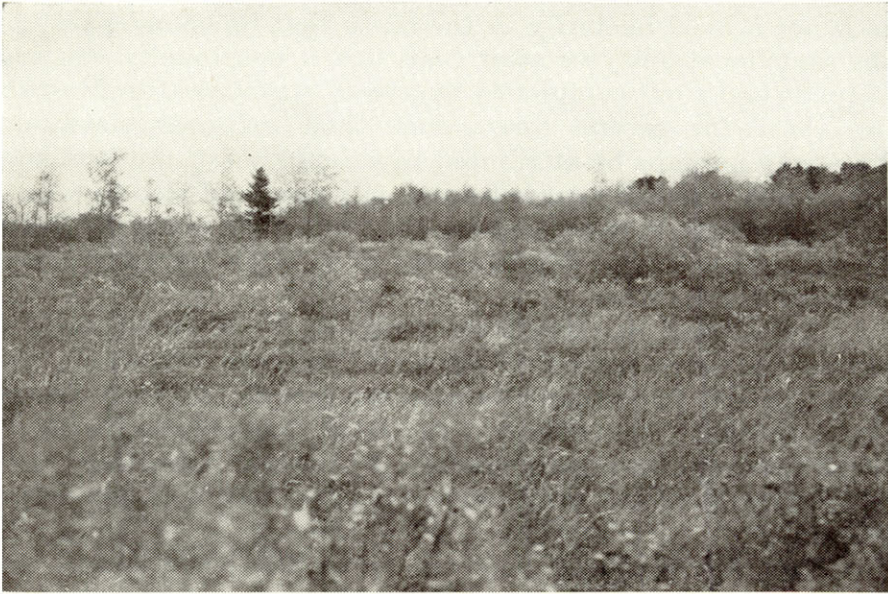
Figure 7. Marsh habitat of Bombycia algens , Hillia iris , Oligia diversicolor and Macronoctua onusta , near Aylesford, Kings County

complex, feeds upon Scotch lovage ( Ligusticum scothicum ) and occasionally on certain other coarse Umbelliferae. These plants are widely distributed, the lovage all around the coast from Cape North to the Bay of Fundy, yet brevicauda seems entirely restricted to Cape Breton Island, and even there is known only from the northern half. The species is not isolated geographically, since the adults are strong flyers that could readily cross the narrow Strait of Canso. So here may be detected the action of an environmental factor apart from food plant requirements or isolation. If it is climate influencing the organisms directly, then brevicauda must require a set of conditions held between relatively narrow limits, since the climate of Cape Breton Island, especially in the coastal zone where brevicauda occurs, does not differ too greatly from that of the adjacent mainland where the species is missing.