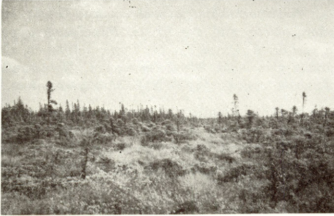
Figure 5. The bog habitat, near Mount Uniacke, of Lycaeides empetri , Hemipachnobia Monochromatea , Carsia paludata and many other species

species. A stretch of boggy black spruce forest near Parrsboro constitutes the southern-most locality for Boloria titania east of the Rocky Mountains.