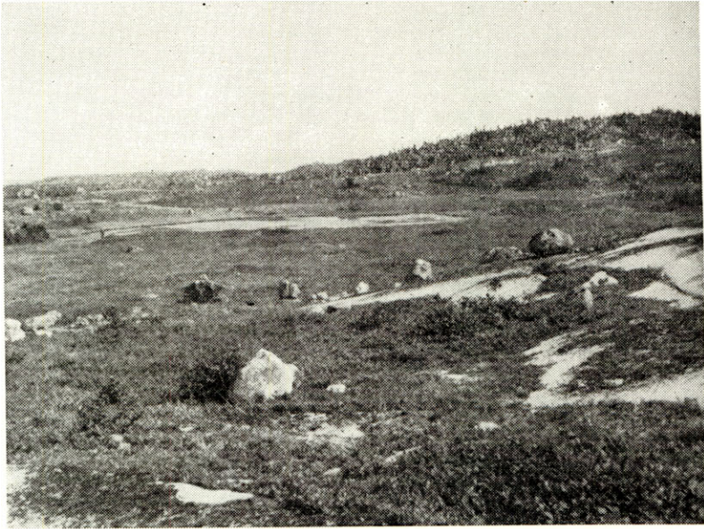
Figure 4. Looking across the barrens between West Dover and Peggy's Cove, Halifax County. This area yielded many interesting species.

Nova Scotia has no truly alpine conditions, but the presence of many cold, damp sphagnum bogs, as well as exposed, barren headlands along the coast, partly compensates for this deficiency. This close to sea level it is only in such locations as these that one may still see the last straggling remnants of a Pleistocene fauna that at one time flourished over much of the continent. On the Mount Uniacke bogs, in association with reindeer moss, crowberry, cloudberry, Labrador tea and other plants of an Arctic-alpine nature, there exists a very local but seemingly strong colony of Anomogyna imperita , which otherwise occurs in the east only in Labrador, northern Quebec and the high mountains of the Appalachians, around timber line. On these and other bogs fly Anarta cordigera , a Lastionycta sp., Syngrapha microgramma , Carsia paludata , Eulype subhastata , Eupithecia gelidata , Oeneis jutta , Lycæides argyrognomon , and other distinctly northern