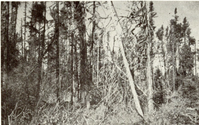
Figure 6. Haunt of Oeneis jutta in the tangle of half dead black spruces, at the edge of the same bog shown above.