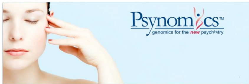
Figure 2: Psynomics Home Page (Psynomics, n.d.)

Psynomics also depicts a potential test user on the home page of their website. Here, the mood is ambiguous. We might imagine her as contemplative, or perhaps concerned. Confused? Perhaps she is having trouble getting an accurate diagnosis.