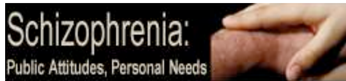
Figure 5: NAMI Home Page (NAMI, 2010). Hands are a recurrent theme in the imagery on these websites, symbolizing interconnection (often between to person who appear to be family members), but perhaps also a certain active capacity.