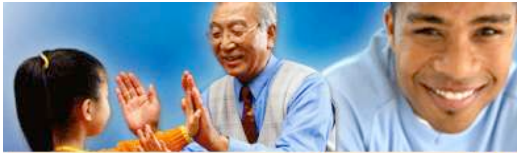
Figure 4: DBSA Home Page (DBSA, 2010). Again, intergenerational connection is highlighted.