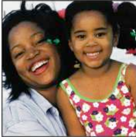
Figure 3: DBSA home page (DBSA, 2010). Here the supportive potential in family relationships is highlighted