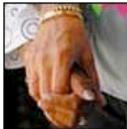
Figure 6: NAMI Home Page (NAMI, 2010).