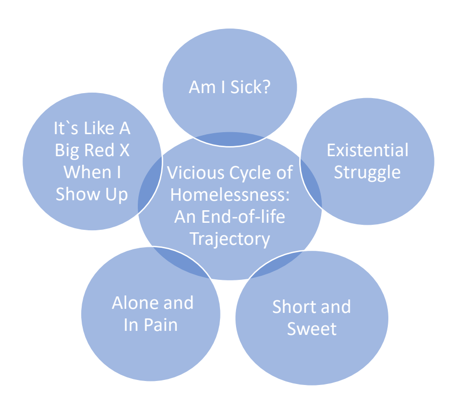
Figure 2: Overview of the 5 primary themes related to the overarching theme: The Vicious Cycle of Homelessness: An End-of-life Trajectory , which illuminates the individuals' experience from a social, political and historical context.

Note: Each of the 5 primary themes in this diagram overlaps with the overarching theme, The Vicious Cycle of Homelessness: An End-of-life Trajectory , to portray the interrelatedness between them.