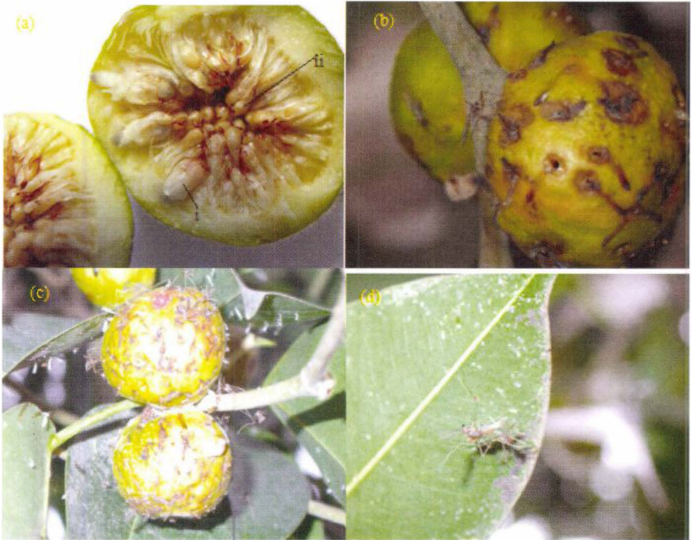
Figure 1. The gall midge associated with Ficus benjamina in Xishuangbanna. (a) (i) A large galled ovule produced by the undescribed gall midge (ii) The smaller galled ovule typical of fig wasps. (b) Gall midge emergence holes on the fig surface. (c) Adult male gall midges waiting for females on D phase figs. (d) Two male gall midges jostling with each other after having jointly carried the same female away from her natal fig. She is still encased within her larval cuticle.