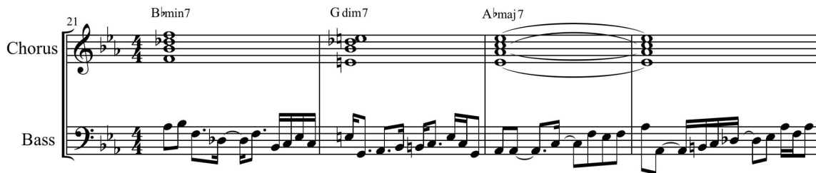
Figure 3.2 Measures 21-25 of “What’s Happening Brother”

and saxophone. The use of the vocal chorus as the main melodic device is very striking in this song as it not only ties the song to the gospel tradition but also gives the song a sense of community and unity, a direct opposition to the lyrical content. The chord structure of this song is very complex and almost chaotic at times. There are three distinct key changes throughout the piece amongst A minor, C minor, and Ab minor, and the stark contrast between the complex, rhythmic bass pattern, and the simple vocal chorus line creates a feeling of disconnect in the music that matches Gaye’s lyrical message.