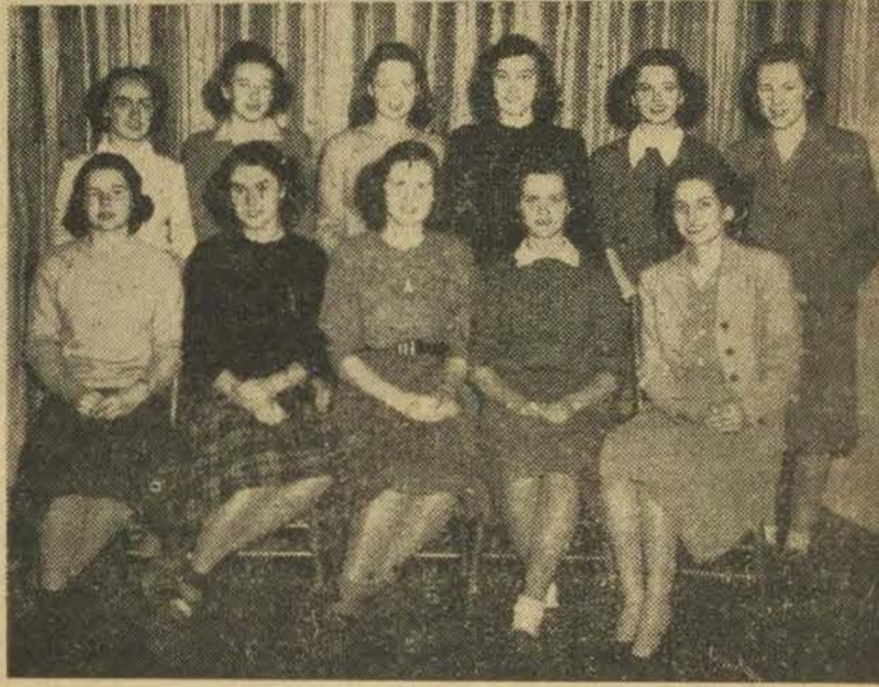
... EXECUTIVE OF D. G. A. C.