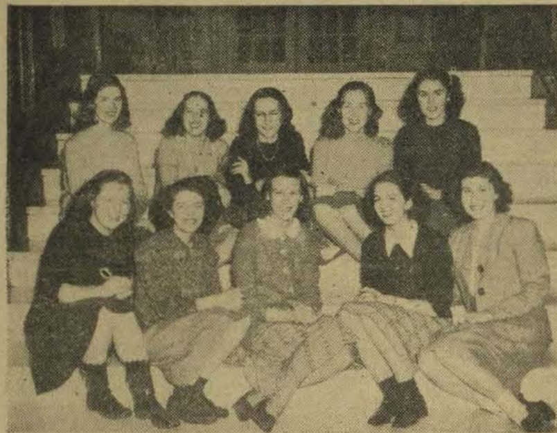
... EXECUTIVE OF DELTA GAMMA