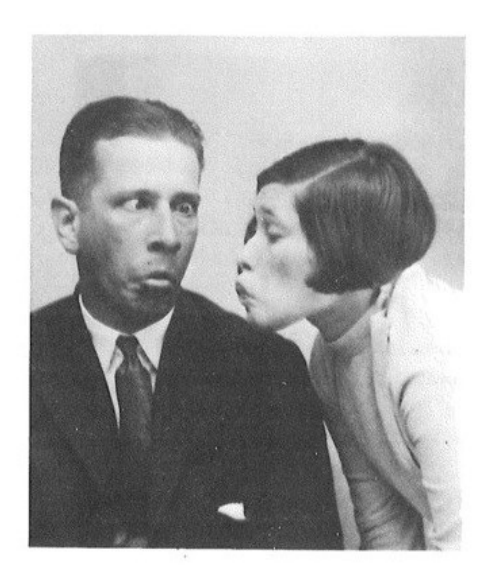
(fig. 1 – "What We Think Of Married Life")

If Ondaatje intends to recollect the "childhood" that "I had slipped past...had ignored and not understood" (16), then Running in the Family reveals that photographs are unreliable transmitters of memory. In contrast, when Ondaatje concludes in the final section of the book that he "must remember everything," he expresses a desire for the "emptiness of a dark room where I listen and wait" (173). In a text that uses photography to address the unreliable and fragmentary nature of memory, this desire for a "dark room" aligns the act of remembering with the craft of developing photographs, and suggests that