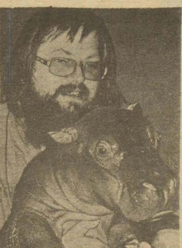
Editor's son and his pet dog Hattie.