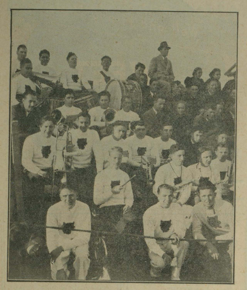
BAND POSES AT ACADIA GAME

College by the Sea has a Brass Band your efforts, keep it up! all its own, seventeen pieces strong It is planned that a Gold "D" will is it not a temptation for the disat the game last Saturday when the be the reward for the members of the appointed and somewhat bewildered Tigers vanquished the lads from Acadia. band who have fulfilled the require-The Band appeared in sight with the ments. There is no reason why the deride the existing order and wish to strains of My Girl's A Crackerjack band cannot be made a major institufloating across the field. It did its tion at Dalhousie. We have the talent, share in urging the Tigers on to victory. the instruments and the time. So such a tendency, not by condemning At last a Dalhousie Band has been lets go! Come to the next game and but rather by a broad study of all firmly established. Dalhousians, it is bring your friends to hear the Dalhousie principles. Don't be discouraged by your duty to see that the band con- Band and see the Tigers in action.