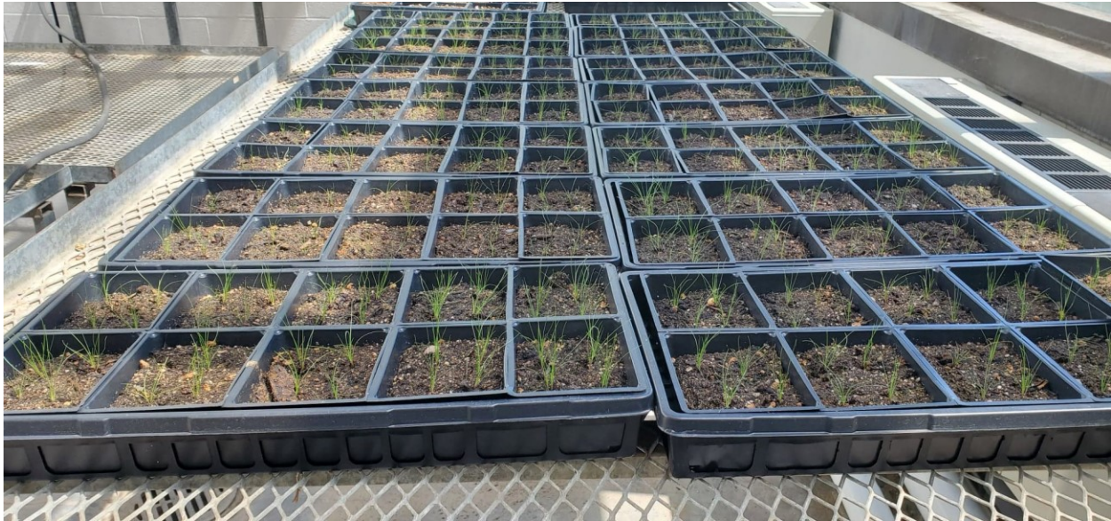
Figure 2.1. Setup for the hair fescue greenhouse efficacy trials. Each site has two trays with two treatments each replicated five times.

at the 7 \pm 0 leaf stage at the time of herbicide applications (Fig. 2.1). Herbicides were applied during daylight hours using a CO 2 -pressurized single nozzle research sprayer equipped with a TeeJet 8002 nozzle and calibrated to deliver 200 L water ha -1 at 276 kPa.