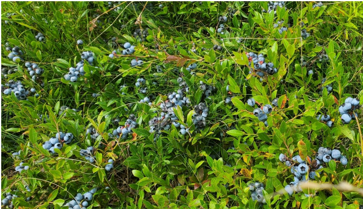
Figure 1.1. Lowbush blueberries ready for harvest with hair fescue growing throughout.

Hancock, 1984). Fields are developed on former farm or woodland that already have blueberry plants present (Government of Canada, 2017; Hall, 1959). Stands are comprised of genetically identical plants, or “clones” that started from seed but now spread via rhizomes (Drummond, 2019; Hall, 1959) The crop is managed on a two year cycle in which stems are mowed to the ground to promote new vegetative growth from the rhizome during the first, or non-bearing year (Eaton et al., 2004) and plants produce flowers and fruit in the second, or bearing year (Fig. 1.1).