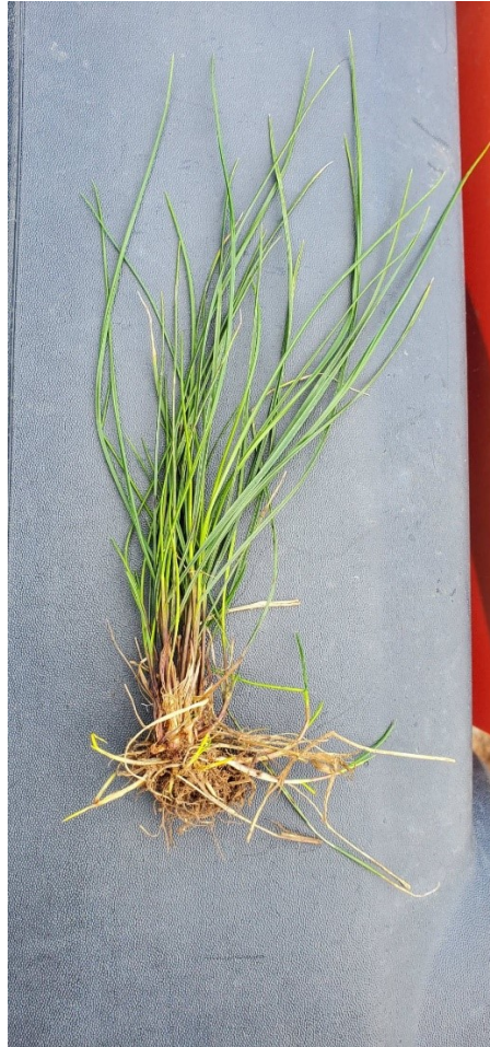
Figure 1.2. Red fescue specimen with a large amount of tillering.