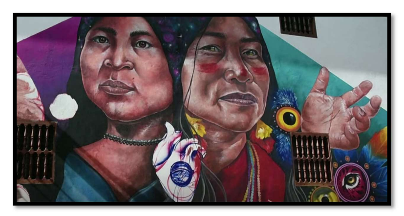
Figure 4.16 Image captured from video taken by CGTN of mural in San Carlos, Colombia (2018)

QUESTIONABLE based on the promotion of pro-state propaganda and heavy censorship by the Chinese Government. The website also states that CGTN has a left/centered bias and is seen as propaganda due to extreme bias, little to no credible sources or information, consistent promotion of conspiracies, and lack of transparency. Videos online have the capability to reach a massive audience and is therefore a powerful medium to use to convey a message due to popularity of the internet (Roser et al., 2015).