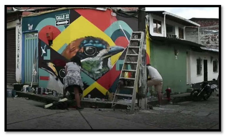
Figure 4.20 Image captured from video taken by CGTN of mural in San Carlos, Colombia (2018)