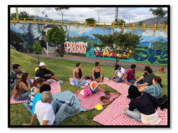
Figure 4.9 Picture taken by members of members of the Social Lab Castilla gather outside at the Castilla Urban Gallery, graffiti art seen in the background, in Medellin, Colombia (2020).