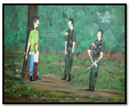
Figure 4.6 Picture taken by Anastasia Moloney for Americas Quarterly magazine of artwork in art exhibit called "The war we have not seen" in Bogota's Museum of Modern Art (2009).