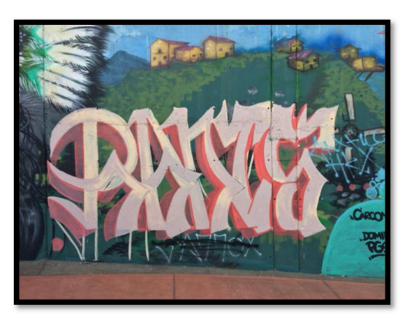
Figure 4.12 Picture of graffiti taken by Social Lab Castilla (2020)