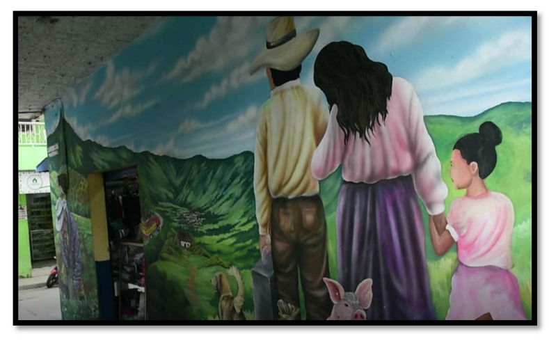
Figure 4.23 Image captured from video taken by CGTN of mural in San Carlos, Colombia (2018)