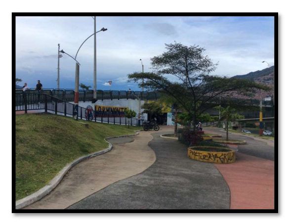
Figure 4.13 Picture by Social Lab Castilla of urbanization and reclamation of space by graffiti artists (2020)