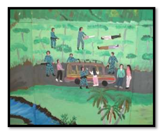
Figure 4.5 Picture taken by Anastasia Moloney for Americas Quarterly magazine of artwork in art exhibit called "The war we have not seen" in Bogota's Museum of Modern Art (2009).