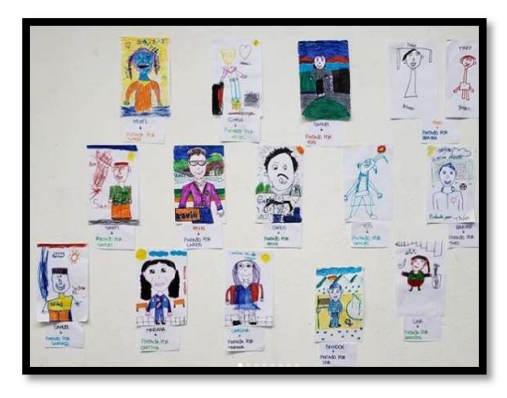
Figure 4.7 Artwork made by young participants in TAAP (Taller de Aprendizaje para las Artes y el Pensamiento program in Colombia taken from Peace Direct (2019).

This article was transmitted via the internet available on the website of the charity called Peace Direct. No information about how much traffic the website has. Peace Direct is a London Based charity that supports and funds local grassroots peacebuilders living in areas of conflict. Their intentions, as posted on their official website, are to prevent conflict, build livelihoods, tackle extremism, support ex-combatants, tackle issues women face in conflict, promote justice and human rights, map peace, advocacy, research and publications, and provide training. This charity had an overall score of 93/100 on Charity Navigator for their finance and accountability, total revenue and expenses, and impact and results and so can be considered a credible and reliable source of information. In terms of the internet, as mentioned in previous analysis, it is a medium that has billions of active users and is therefore a medium can potentially reach a massive audience (Roser et al., 2015).