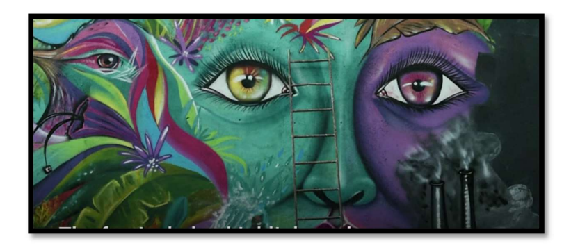
Figure 4.24 Image captured from video taken by CGTN of mural in San Carlos, Colombia (2018)