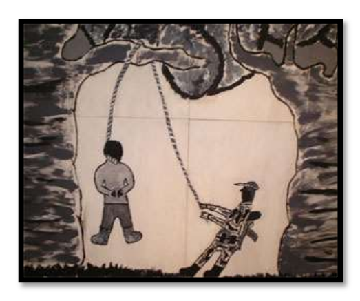
Figure 4.4 of artwork in art exhibit called "The war we have not seen" in Bogota's Museum of Modern Art (2009).