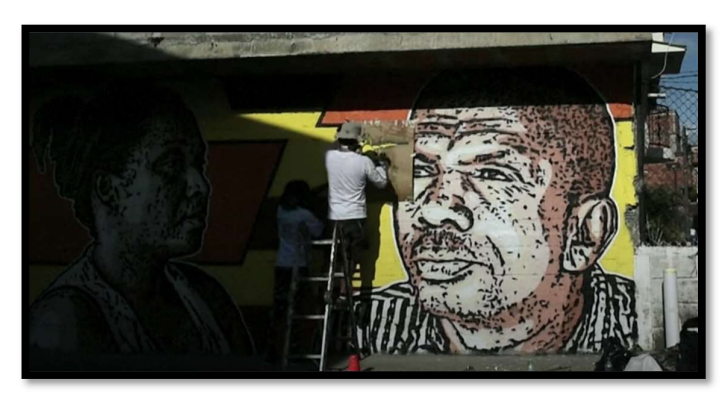
Figure 4.28 Image captured from video taken by CGTN of mural in San Carlos, Colombia (2018)