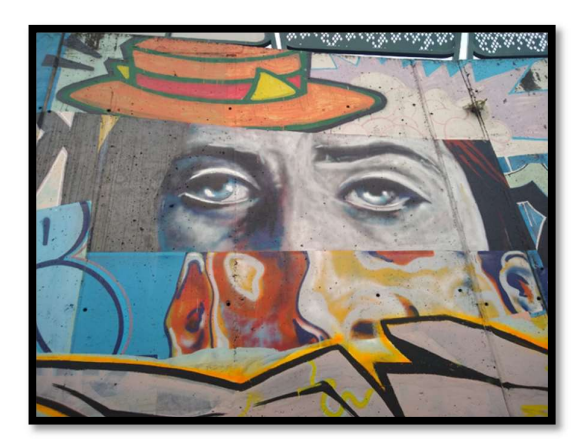
Figure 4.10 Picture by Social Lab Castilla of graffiti art depicting eyes (2020)