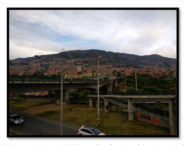
Figure 4.11 Picture taken by Social Lab Castilla of a view of the other end of the bridges with graffiti that connect the comuna (meaning municipality in Medellin, Colombia) (2020)