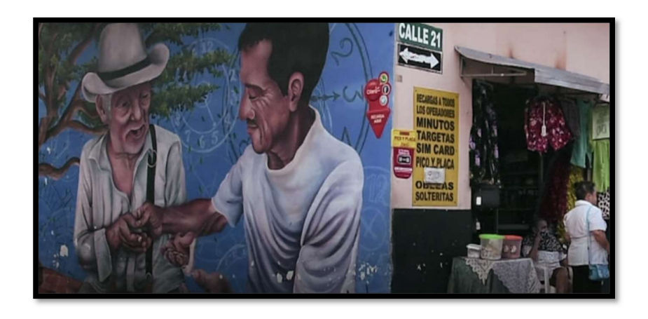
Figure 4.18 Image captured from video taken by CGTN of mural in San Carlos, Colombia (2018)