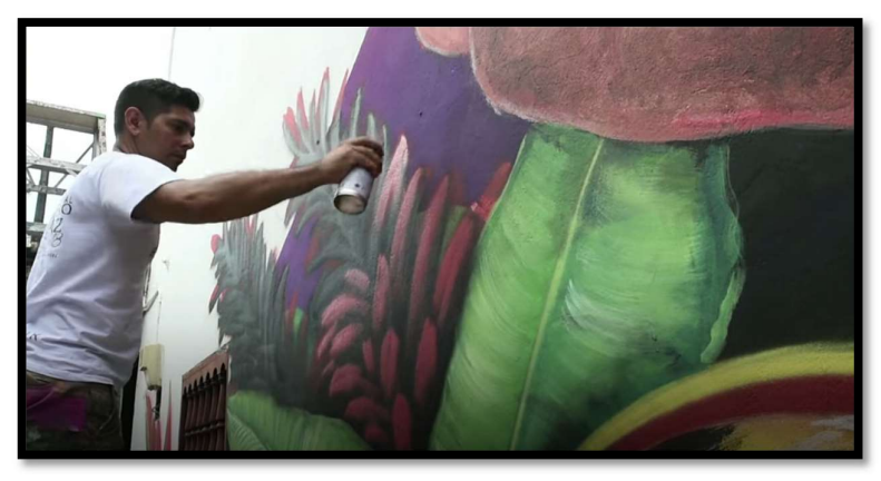
Figure 4.21 Image captured from video taken by CGTN of mural in San Carlos, Colombia (2018)