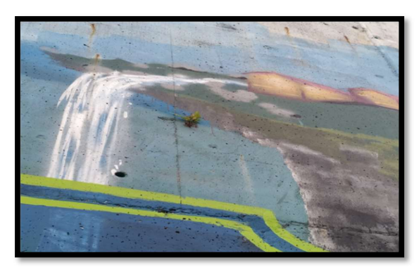
Figure 4.15 of graffiti depicting nature (2020)