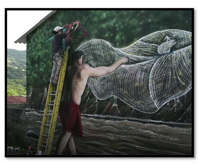
Figure 4.22 Image captured from video taken by CGTN of mural in San Carlos, Colombia (2018)