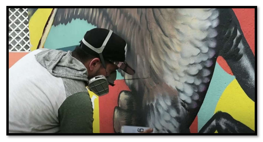
Figure 4.17 Image captured from video taken by CGTN of mural in San Carlos, Colombia (2018)