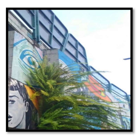
Figure 4.14 Picture taken by Social Lab Castilla of graffiti and nature reclaiming bridge in Medellin, Colombia (2020)