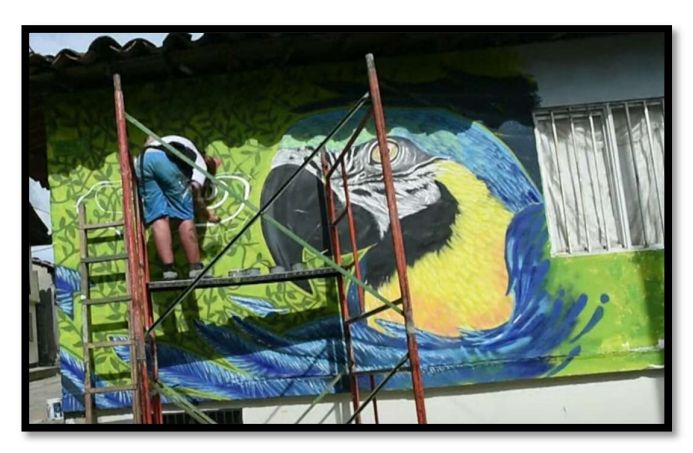
Figure 4.27 Image captured from video taken by CGTN of mural in San Carlos, Colombia (2018)