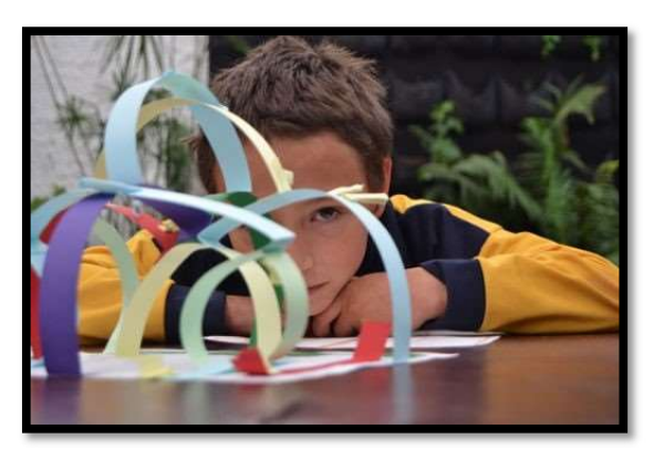
Figure 4.8 Child posing with art project created by participant in TAAP (Taller de Aprendizaje para las Artes y el Pensamiento) program in Colombia