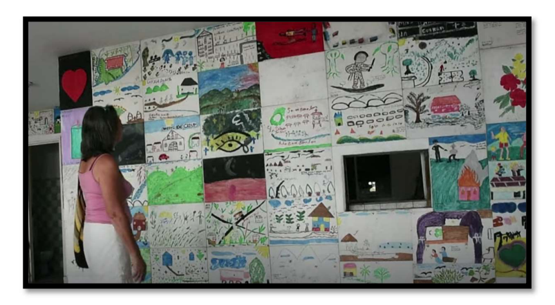
Figure 4.25 Image captured from video taken by CGTN of mural in San Carlos, Colombia (2018)