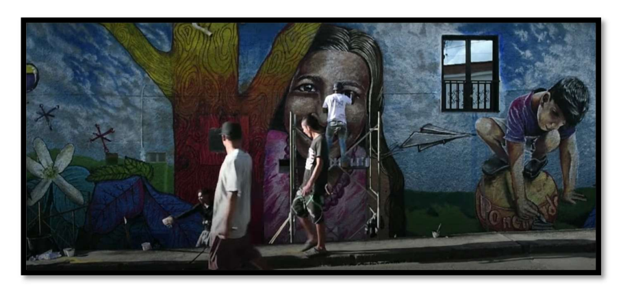
Figure 4.19 Image captured from video taken by CGTN of mural in San Carlos, Colombia (2018)