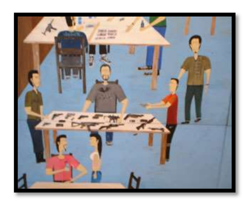
Figure 4.3. Picture taken by Anastasia Moloney for Americas Quarterly magazine of artwork in art exhibit called "The war we have not seen" in Bogota's Museum of Modern Art (2009).

The channel in which this message was transmitted from the sender to the receiver is through an online magazine. Access to article was free, as long as reader has access to internet and device with which to view it. Magazine was featured and published by Americas Quarterly , an American magazine founded in 2007. Proclaimed itself to be as a source of "Politics, Business & Culture in the Americas" and that their main goal is "promoting free trade, democracy, and open markets throughout the Americas. This included Canada, Mexico, and the Caribbean, as well as South America." ( Americas Quarterly , n.d.). Has a right/center bias, medium traffic to the magazine by viewers, and rated HIGH by Media Bias/Fact Check for factual reporting due to proper sourcing and a clean fact checks record. However, Media Bias/Fact Check also uncovered that the publisher of this magazine has connections to major banks, tech giants, and extractive corporations. Also accused of propaganda relating to Latin America in the interests of its patrons, such as Bloomberg by Media Bias/Fact Check . Traffic on the internet, the medium in which it was uploaded, is extremely vast, with estimates of 3.5 billion or more (Roser et al., 2015).