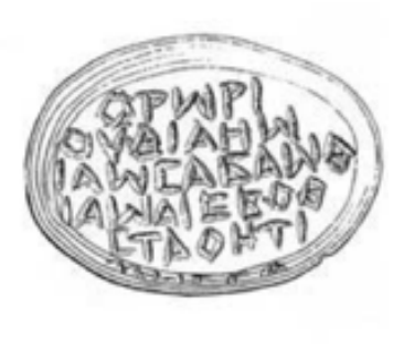
Figure 1. Incantations written on hematite gemstones from Imperial Rome reveal common features, such as commands for the uterus to "stop!" moving, as well as the common depiction of the uterus as an upside-down jug. From Faraone, 2011.

direction throughout the body [...] and provokes all other kinds of diseases.