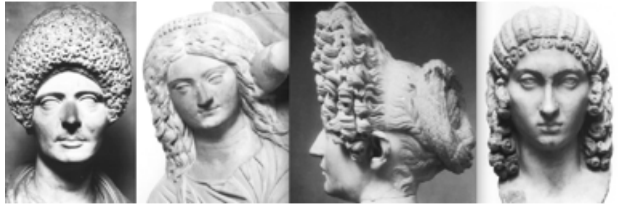
Figure 3. Various busts of women from the Roman Empire demonstrating the wide range of elaborate hairstyles available to women 6

What does this inconsistency - that they would