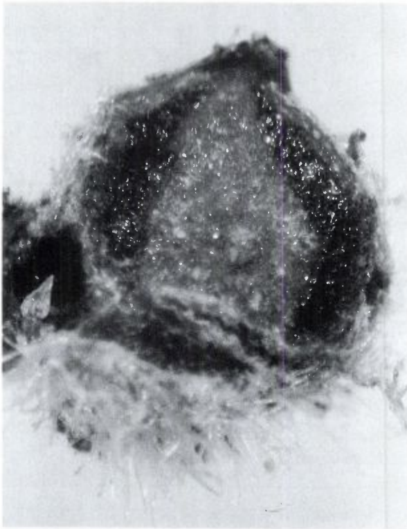
Figure 1. Cross section of a coralloid root of Zamia furfuracea . The dark green region consists of densely packed cyanobacteria. The root had a width of roughly 3 mm.

Reconstitution of the plant with its native cyanobacterium and with other cyanobacteria was attempted using seedlings of Z. furfuracea . Cyanobacterial growth was clearly evident and growth of the cycad was sustained in all inoculated containers but not in the uninoculated control. Two months after inoculation, several coralloid roots were sectioned. All coralloid roots taken from a plant grown with Nostoc FUR 94210 exhibited green cyanobacterial zones typical of infected cycad roots, as did coralloid roots from three plants